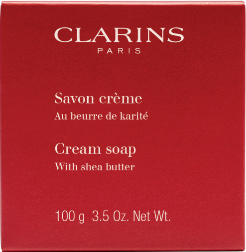
CREAM SOAP IN A CARDBOARD BOX 100 g - 3.5 Oz. Net Wt.